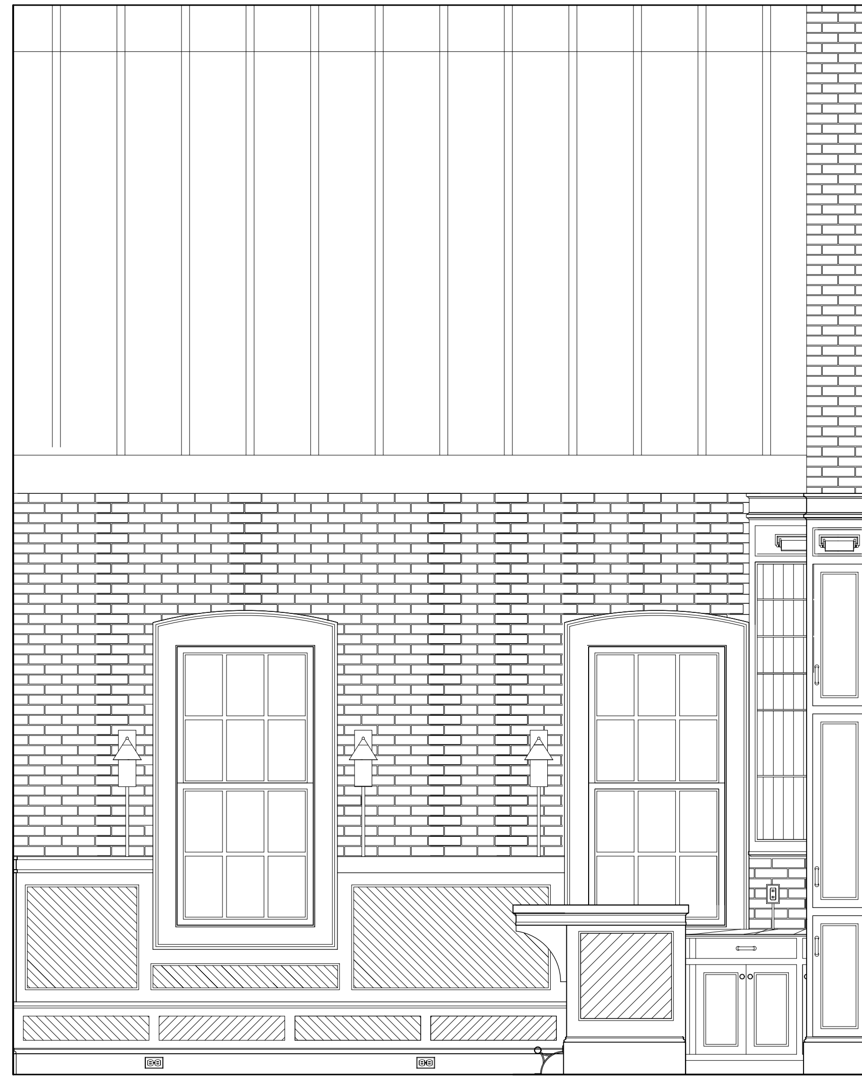
2 MAIN DINING ROOM: WEST ELEVATION 1-1.1 Scale: 1/2"=1'-0"