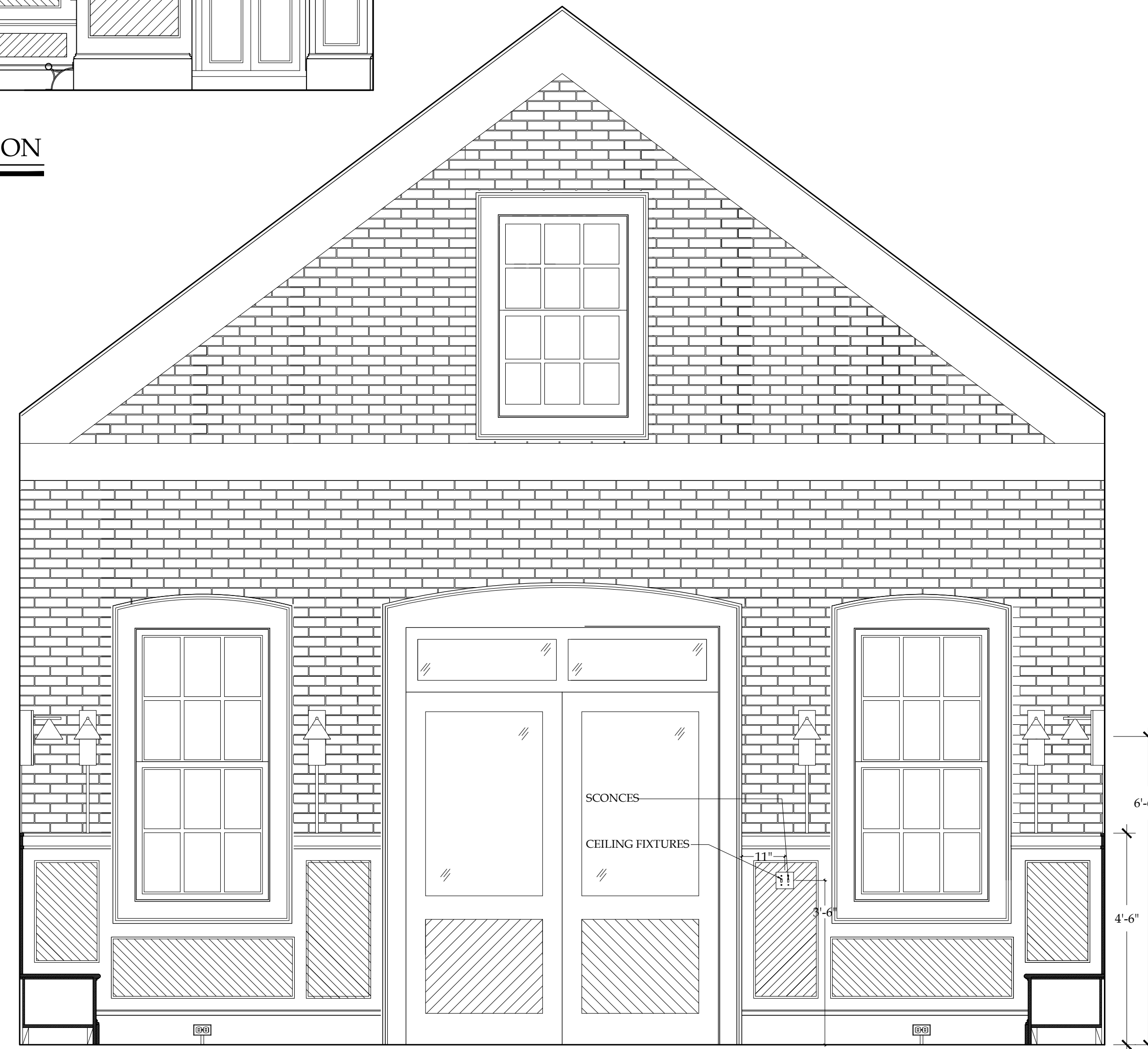
4 MAIN DINING ROOM: SOUTH ELEVATION 1-1.1 Scale: 1/2"=1'-0"

86 PONDFIELD ROAD WEST, BRONXVILLE, NEW YORK 10708